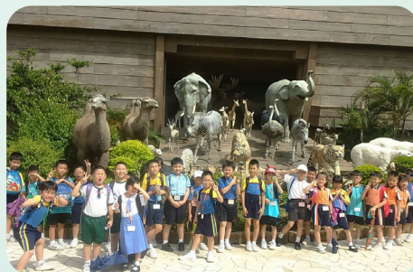
Social Exposure by Noah's Ark