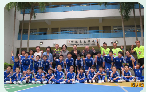
Sports Exposure by ChelseaFC Soccer School (HK) Football Training