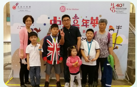
Music Exposure by Hong Kong Chinese Orchestra