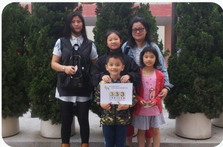
Arts Exposure by Angela Children's Theatre

A harmonious family supports children in positive development