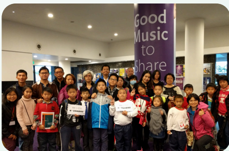
Music Exposure by Hong Kong Association of Youth Development