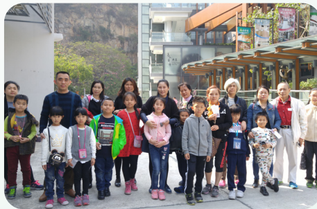
Arts Exposure by Hong Kong Ballet