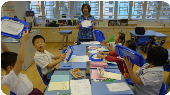
Interactive Academic Assistance Sessions

A 3 program modules, 18 months total solution Includes,