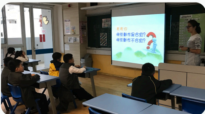
Trans-professional Educational Psychology Support Services for student with Special Educational Needs (SEN)