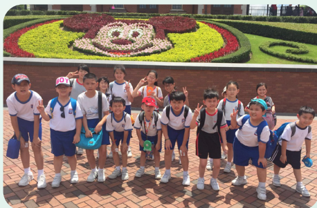
Social Exposure by Hong Kong Disneyland