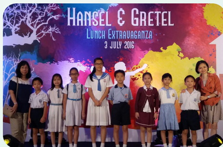
Arts Exposure by Opera Hong Kong