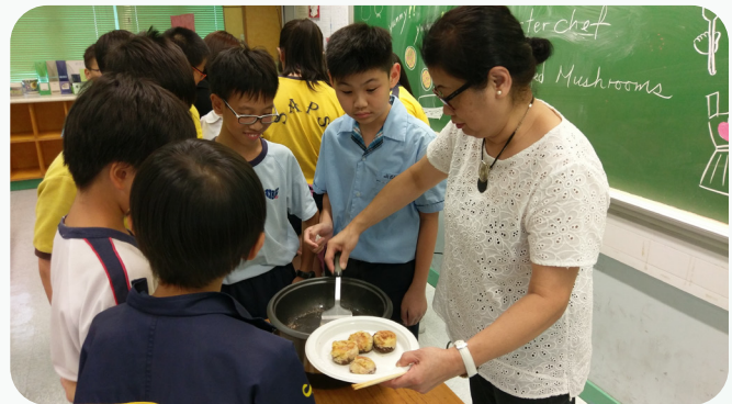
Engaging Value-added Programs