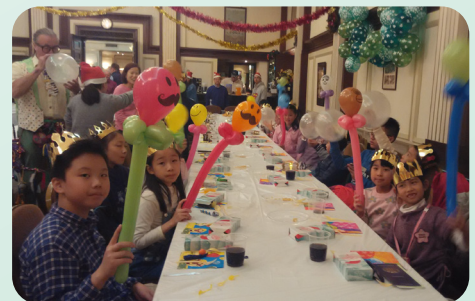
Social Exposure by Zetland Hall